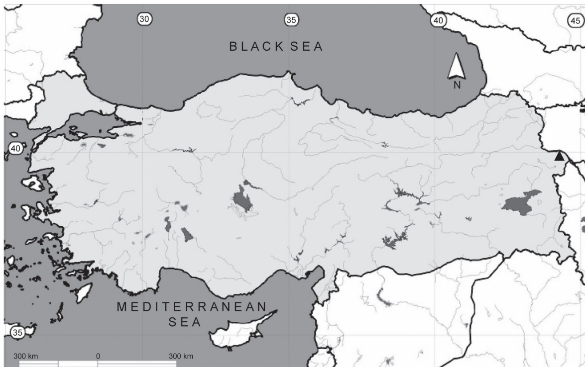
Fig. 1. A map showing the recorded locality (▲) of Myocastor coypus in Aralık (Iğdır), Turkey.

20 to 30 metaphase plates were examined. Chromosome morphology was established according to ZIMA (1978) by calculating centromeric indexes. Each autosomal pair and both sex chromosomes were identified. Standard voucher specimens (skins and skulls) are deposited in the Department of Biology, Faculty of Science and Arts, Kırıkkale University, Kırıkkale, Turkey.